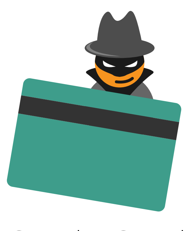
True Credit Card